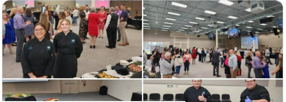
Our Culinary Academy students serve our community during Art Walk Downtown #ArtWalk #CulinaryAcademy #DowntownFortMyers